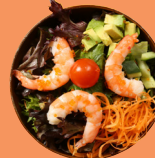
Cooked Prawn $4.80 ☺