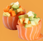
Vegetable & Salmon $5.80 ☺