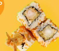
Tempura Prawn $3.80