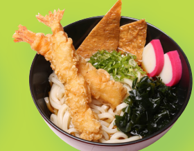
Tempura Prawn $8.60