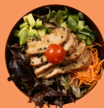
Teriyaki Chicken $4.80 ☺