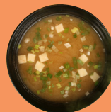
Miso Soup $2.80