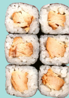
Teriyaki Chicken $3.30