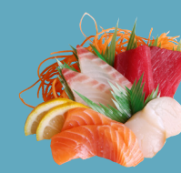
Assorted $11.60 ☺