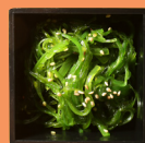
Seaweed $2.80 ☺☺