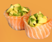
Avocado & Salmon $5.80 ☺