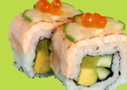
Salmon & Vegetable $4.80 ⑨