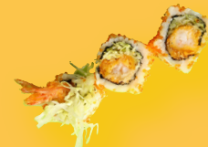
Ebi Katsu $3.80