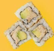
Tuna Salad & Avocado $3.30 ☺