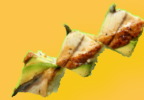
Unagi Avocado $3.80