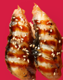
BBQ Unagi $3.80 ⑨