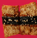
Chicken Hamburg $3.30