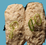
Tuna Salad $3.30 ⑨