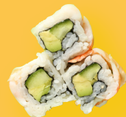
Prawn & Vegetable $3.80 ☺