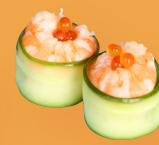
Prawn & Cucumber $4.80 ☺