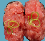
Spicy Fresh Tuna $3.80 ⑨