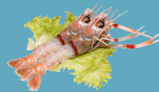
Scampi $6.80 ☺