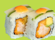
Spicy Prawn Katsu $4.80