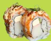
Grilled Salmon & Crab Leg with Cheese $5.80