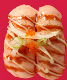
Grilled Salmon $3.80 ⑨