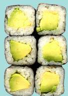
Avocado $2.80 ⑨⑨