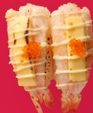
Grilled Ebi with Cheese $3.80