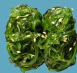
Seaweed Salad $3.30 ⑨