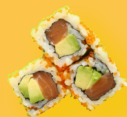
Fresh Salmon Avocado $3.80 ☺