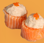
Tuna Salad & Salmon $5.80 ☺