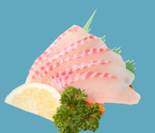
Snapper $6.80 ☺