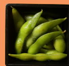
Edemame $2.80 ☺☺