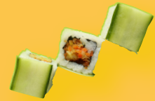
Tempura Vegetable $3.30 ☺