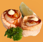
Grilled Scallop & Grilled Salmon $6.80 ☺