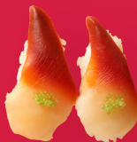
Raw Surf Shell $3.30 ⑨