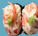
Crab Stick Salad $3.30 ⑨