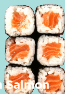
Fresh Salmon $3.30 ⑨