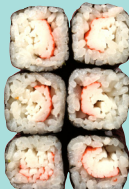
Crab Stick $2.80 ⑨