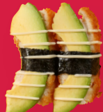
Crispy Chicken Avocado $3.80