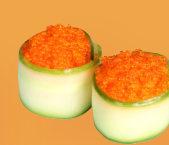
Tobikko & Cucumber $4.80 ☺