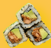
Crispy Teriyaki Salmon $3.80