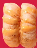
Grilled Spicy Tuna $3.80