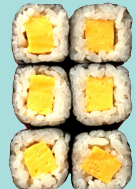
Tamago $2.80 ⑨⑨