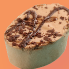
Mars Bar Cheesecake $3.80