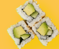
Avocado Cucumber with Mayo $3.30 ☺