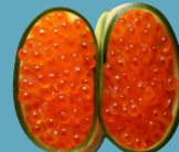
Ikura $4.80 ⑨