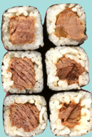
Teriyaki Beef $3.30