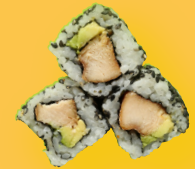
Teriyaki Chicken Avocado $3.30