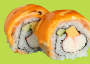
Spicy Crab Stick with Cheese $4.80