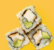
Crispy Chicken Avocado $3.30