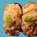
Lobster Salad $3.30 ⑨