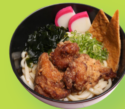
Chicken Karaage $8.60