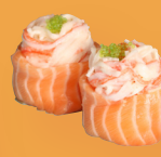
Crab Stick Salad & Salmon $5.80 ☺