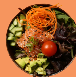
Fresh Salmon $4.80 ☺