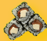
Smoked Salmon & Cream Cheese $3.80 ☺