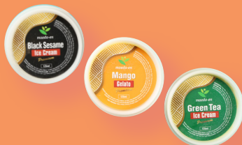
Ice Cream (Black Sesame or Mango or Green Tea) $3.80 each