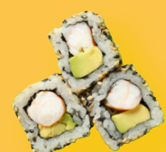
Prawn Avocado $3.30 ☺