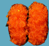
Tobikko $3.80 ⑨