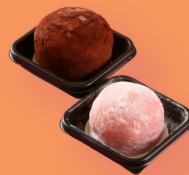
Mochi (Chocolate or Strawberry) 2 for $4.80