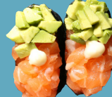
Salmon & Avocado $3.80 ⑨