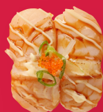
Grilled Scallop $4.80 ⑨