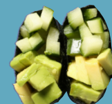
Avocado Cucumber & Mayo $2.80 ⑨⑨