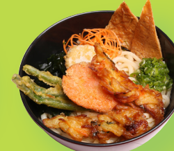
Tempura Vegetable $8.60