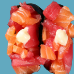
Fresh Salmon & Tuna $3.80 ⑨