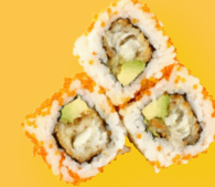
Fish-O-Filet Avocado $3.80