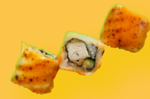
Spicy Chicken Katsu with Cheese $3.80