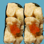
Abalone Salad $3.30 ⑨