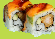
Spicy Tempura Prawn $4.80