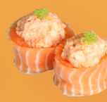
Lobster Salad & Salmon $5.80 ☺