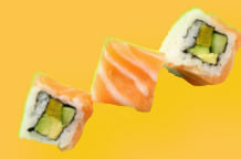
Salmon & Vegetable $3.80 ☺