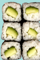
Cucumber $2.80 ⑨⑨