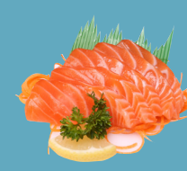
Salmon $6.80 ☺