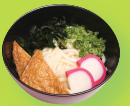
Tofu Pastry & Seaweed $6.80