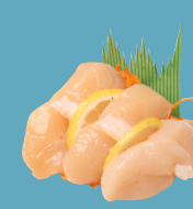
Scallop $6.80 ☺