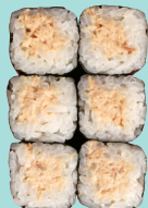
Tuna Salad $3.30 ⑨