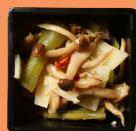
Mushroom $2.80 ☺☺