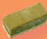
Matcha Cheesecake $4.80