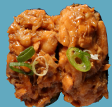
Teriyaki Salmon $3.80