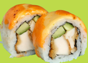
Spicy Crispy Chicken with Cheese $4.80