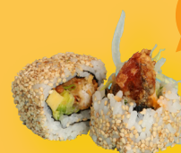
Soft Shell Crab $4.80