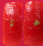
Raw Tuna $3.30 ⑨