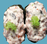
Octopus Salad $3.30 ⑨