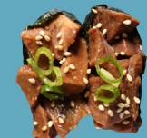
Teriyaki Beef $3.30