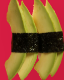
Avocado Nigiri $2.80 ⑨⑨