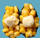
Sweet Corn & Mayo $2.80 ⑨⑨