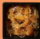
Jellyfish $2.80 ☺