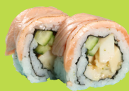
Grilled Salmon & Abalone Salad $5.80 ⑨