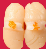
Raw Scallop $3.80 ⑨